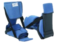
Soft Pro AFO L4396