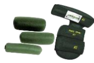
Leedergrip Handsplint L3809