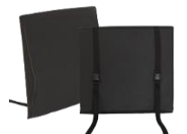
Protekt Back Cushion E2611