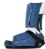
Soft Pro Gait Trainer L4396