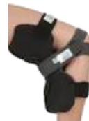
Care Rest Knee Brace L1831