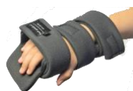
Care Resting Handsplint L3809