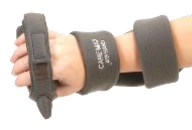
Care MAX Handsplint L3809