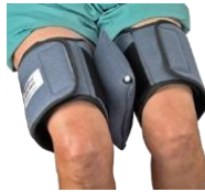
Hip/Thigh Adductor L1652