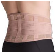
Thermoskin Back Brace L0627