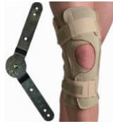
Thermoskin Knee Brace L1833