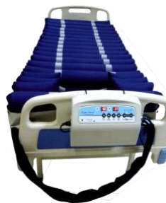
Powered Air Mattress E0277