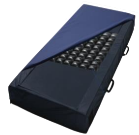
Non-Powered Air Mattress E0373